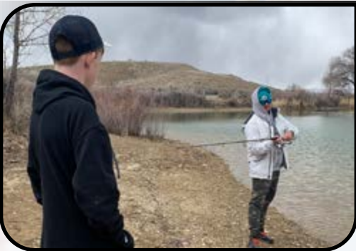
P.20 WISHIN' FOR A FISH