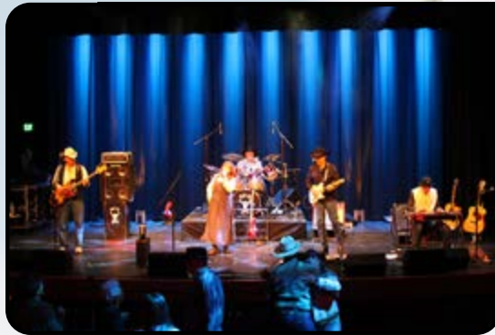
OUTLAW COUNTRY UTE THEATER P. 12