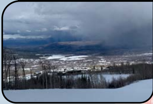
GOOD BYE SWEET SKI SEASON P. 8